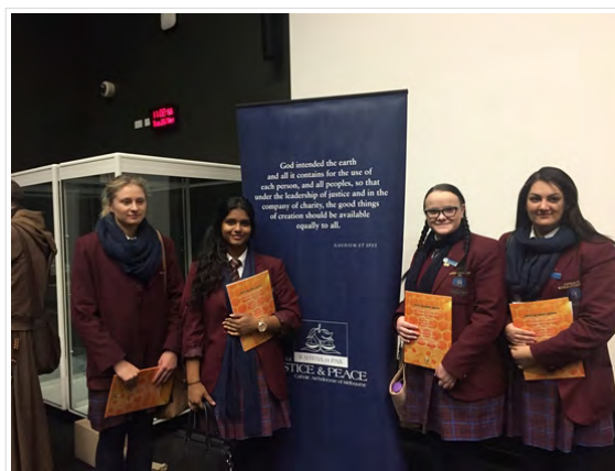
Student Leaders Faith & Liturgy and Social Justice