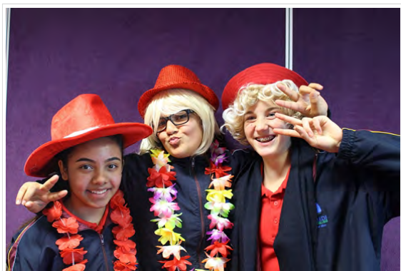
McCormack students enjoying the Feast Day activities