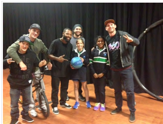
The 360Allstars visit Marymede Catholic College