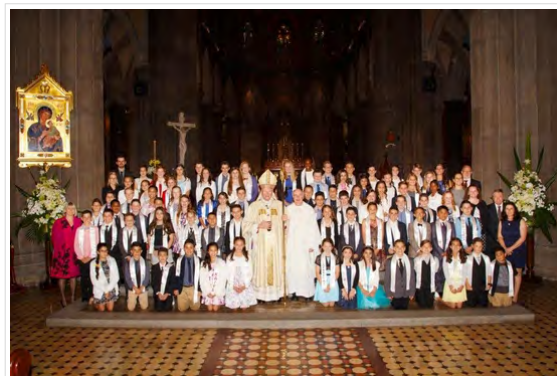
The 2015 Confirmation Candidates and Staff

We congratulate the Candidates in their final step of initiation into the Catholic faith. We pray that the Holy Spirit guides these students on their life journey.