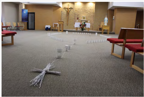
Walking Rosary loaned by Archbishop's Office for Evangelisation, September 2014

you, praying to you while you pray for us. May you fill our family with love and peace in our homes as once you did at Nazareth with Jesus and Joseph, filling them with the holiness of your presence and inspiration. Amen.