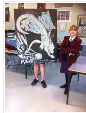
Year 10 students prepared Catching some fun while chalk 'edible art' drawing a 'dragon'