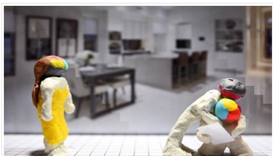
'The Creativity Cycle' by Andrew Fu

I look forward to sharing more successes with you in 2019.