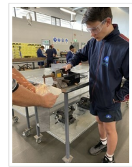
welding his tool caddy.