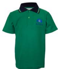
Sports Polo Top Jnr