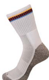
Sports Sock 2 pkt