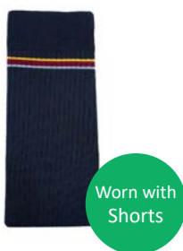
Sock Stripe Navy

For current prices, please refer to www.bobstewart.com.au