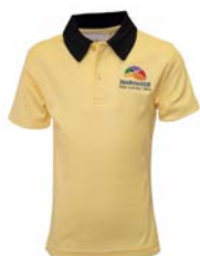
ELC Polo Top