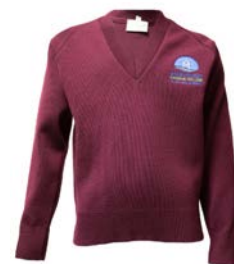
Pullover Maroon VCE