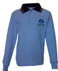
Polo Top Long Sleeve