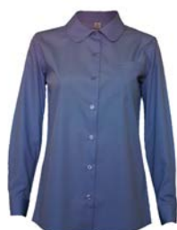
Peter Pan Blouse