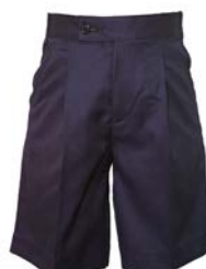
Shorts fly front