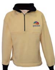
ELC Top 1/4 Zip