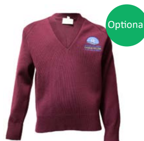
Pullover Maroon VCE