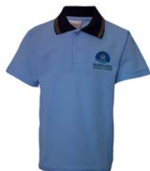
Polo Short Sleeve