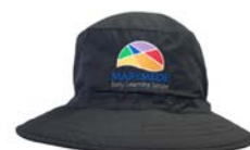
ELC Bucket Hat