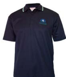
Sports Polo Top