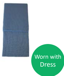
Anklet Sock Sky blue