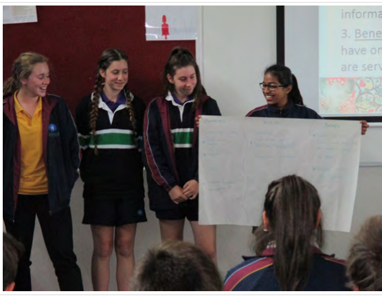
Students presenting their Social Justice Campaign

Students interested in the program will attend the Red Embarkation Camp from March 7-9, 2016 at Palotti College Milgrove.