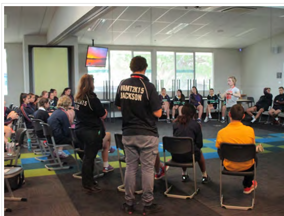
Students learning about Music Ministry

Following a busy week of studying and completing exams, Year 9 students ended Week 8 with an immersion day led by the team from Marist Youth Ministry. The day provided students with an opportunity to unwind and engage in a series of activities with their peers. There were three workshops giving students a taste of the REMAR program on offer for Year 10 students in 2016.