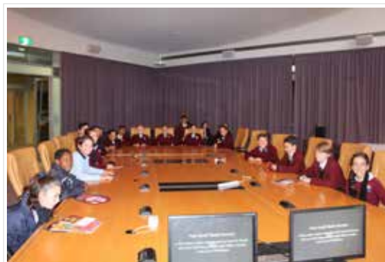
Leaders enjoy sitting around the table in the Grand Hall where the Mayor and Councillors regularly meet