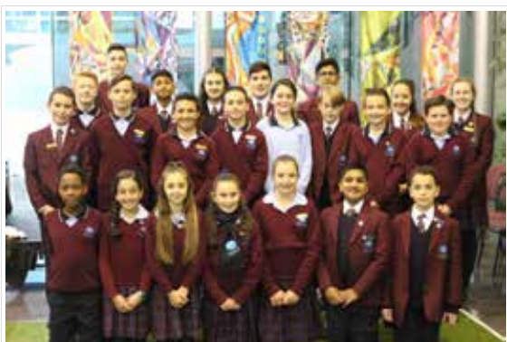
Student Leaders at the Council prior to the commencement of the celebrations