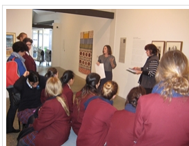
Briefing by the Marketing Manager at Heide Museum of Modern Art